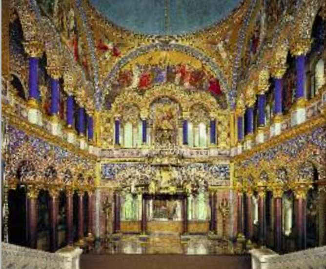
The walls of the Throne Hall glorify canonized kings and their deeds.