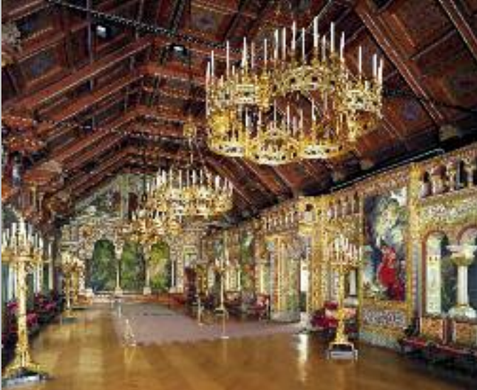
The Singers' Hall on the fourth floor of the castle