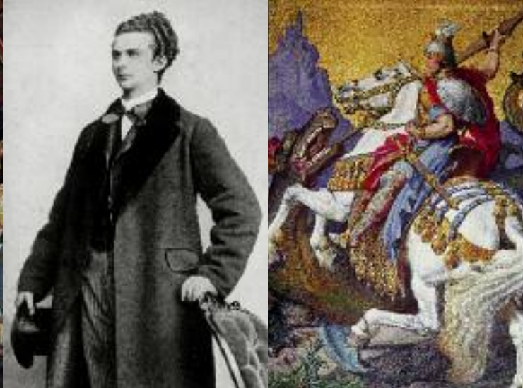
Photo of King Ludwig II (left); Mural of »St. George killing the dragon« from the Throne Hall (right); Majolica swan (below)