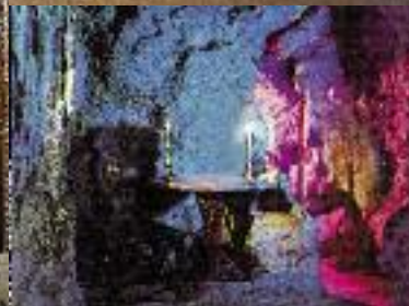
Palace kitchen (top left); Grotto with coloured lighting (bottom left); Study (right); Jewellery casket (below)